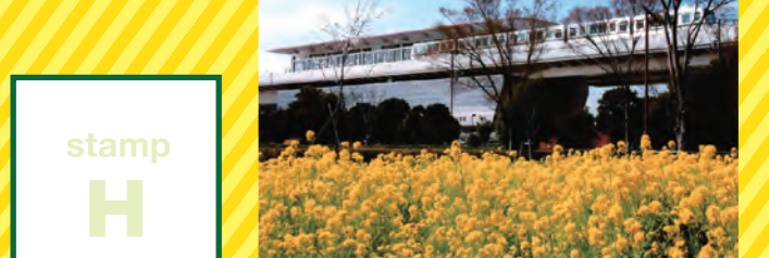
Stamp is in the bicycle parking lot under Toneri-Koen Sta.

It's one of Tokyo's largest parks with a dog's park, a giant hill slide, a BBQ area, a tennis court etc. and a toll parking lot.