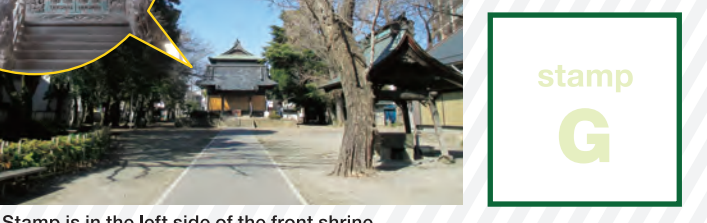
Stamp is in the left side of the front shrine.

The current beautiful wooden shrine was built entirely of cypress in 1836. The main hall is decorated with stunning sculptures of a dragon, a lion and a peony. Although they are protected by a fence, you can see them clearly, so it is definitely worth viewing. "Toneri Bunka market" is held in December.