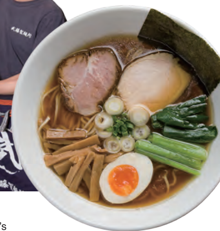
soy sauce Ramen

6-7-14Takenotsuka ☎ 03-3850-4551 Additive and chemical free homemade noodles made from domestic flour have five choices of noodle’s thickness and two tastes of rich chicken or seafood and chicken soup.