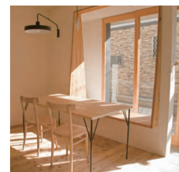
The event room of Wakamiya Haitsu apartment