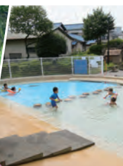
10 Toneri Ikiiki Park (alias Damon Park) 6-3-1Toneri The Big Damon Slide is very popular with children.