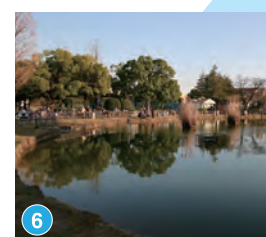
6 Motofuchie Park (with the park of living things) 2-17-1Hokima It has the park of living things and a fishing pond too.

Adachi City has the largest park area in Tokyo’s 23 wards. There are lots of well-maintained parks for relaxation and refreshment for everyone from children to elderly people. It also has many unique parks where families can enjoy themselves all day long. You can use lots of well-equipped facilities for sport, such as a bathing center and a golf center at a reasonable price. Please don’t forget to visit many historic temples and shrines as well as ancient remains.