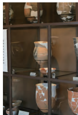
The display in Ikou Iseki Park (D stamp)

In the ancient period when the Kanto Plain was mostly under water, Ikou district was on the coast of the Tokyo Bay, which was much larger at that time. Many people lived here and traded with Western Japan through the sea. A lot of unearthed articles displayed in Ikou Iseki Park show us the fact that this area was one of the most developed areas in the Kanto Plain.