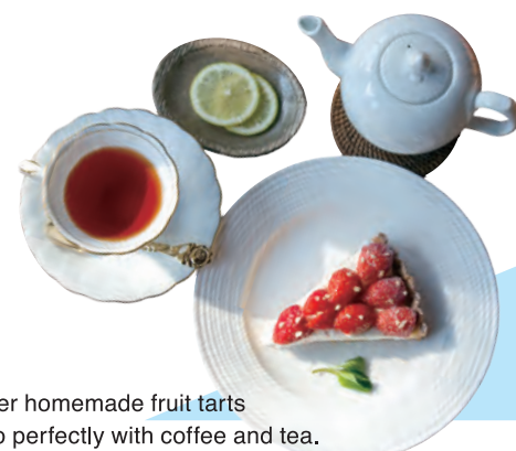
Her homemade fruit tarts go perfectly with coffee and tea.