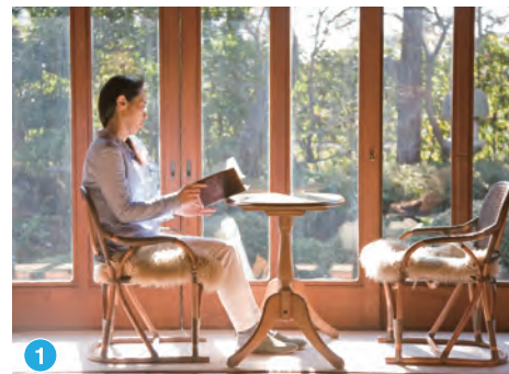
Engawa Café (Showa House) 2-5-10Nishi hikima ☎ 03-3883-0011 Open: 11:30~18:00 (Tuesday ~Friday)

“Showa House” used to be the residence of a metalworking factory owner and was designated as the Tangible Cultural Property of Japan for the first time in Adachi. The house was renovated as a café, because its Showa retro style was loved by many people. How about homemade sweets with coffee?