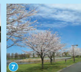
7 Toritsu Toneri Park 1-1Tonerikouen It’s the largest park in Adachi City, which has a BBQ area and a ballpark and so on.