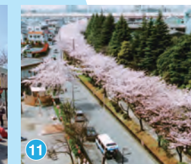
11 Toneri Ryokudo Park 6Toneri~9Iriya It’s a viewing spot famous for the 1.2km long tunnel of cherry blossoms alongside the Kenaga River in the spring.